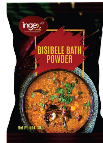
BISIBELE BATH POWDER